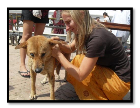
Blind Mommy & Andrea

Photos below are just a very few of the loving street dogs Cared for by Street Dog Care, Kathmandu.