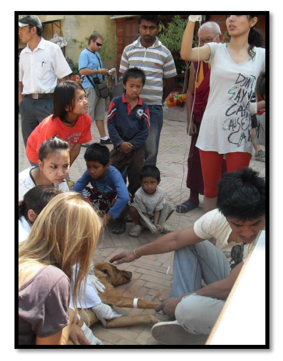
Doctors and Volunteers treating Brownie on the street w/ local onlookers.