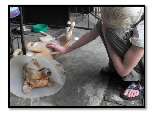
Oro, post spay, being pet by a volunteer and maybe thinking she is in Heaven.